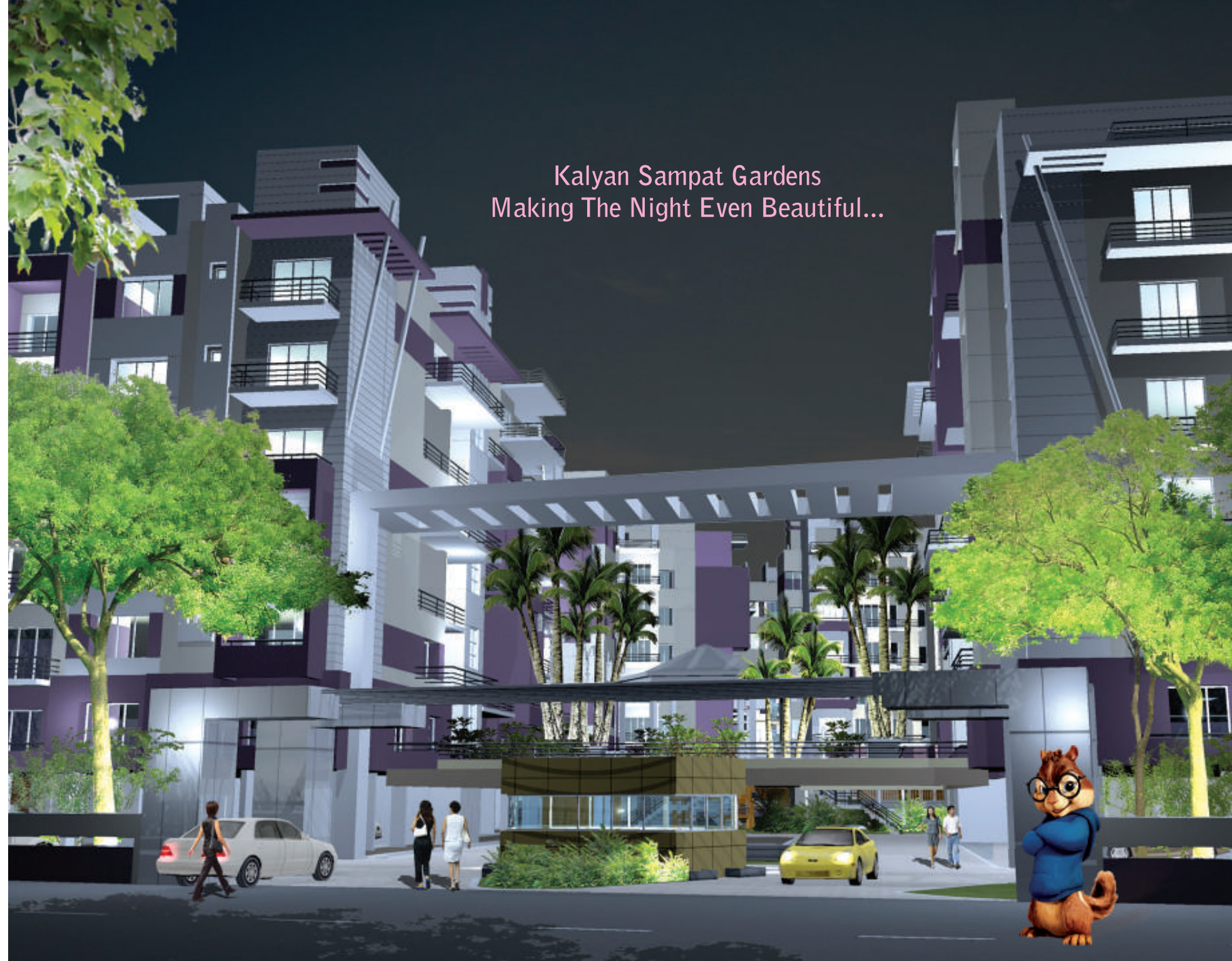
Kalyan Sampat Gardens Making The Night Even Beautiful...