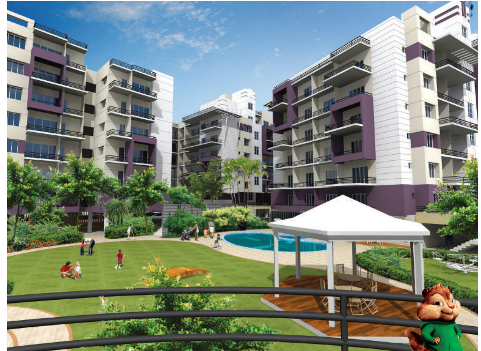
Central Plaza With Gazebos/Tracks