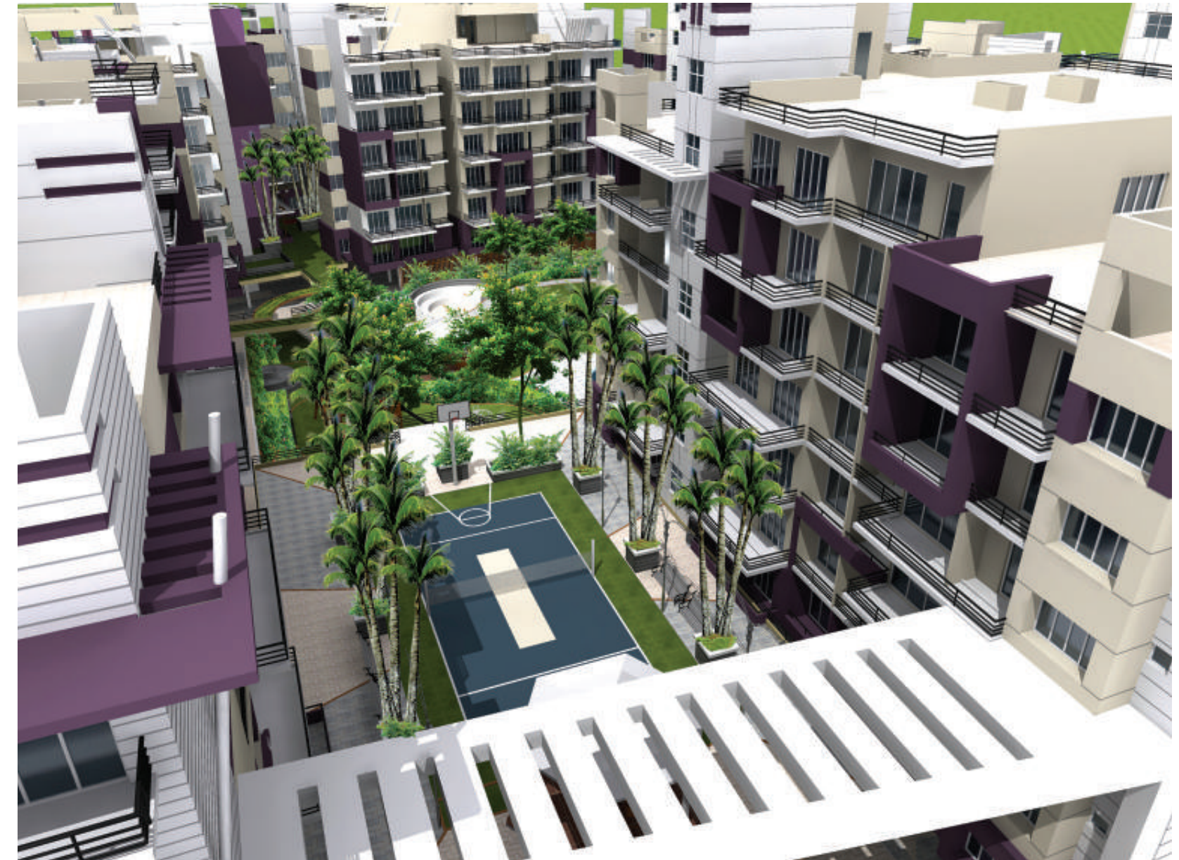
Sports Plaza (2-Level Garden)

All amenities / specifications shown in this page are tentative and subject to change without notice.